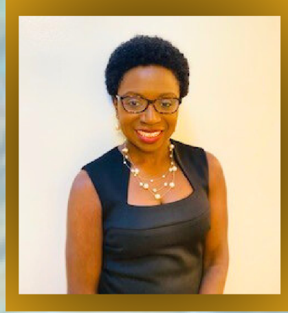
Hon. Tamra Walker